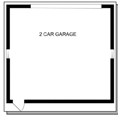
OPTIONAL DETACHED 2 CAR GARAGE