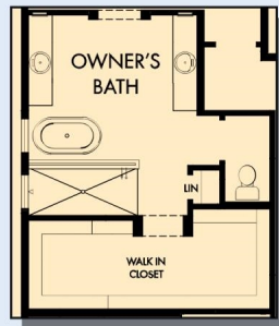
OPTIONAL FREE STANDING TUB AT OWNER'S BATH