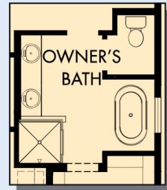
OPTIONAL FREE STANDING TUB WITH SEPARATE SHOWER AT OWNER'S BATH