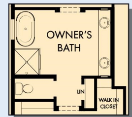
OPTIONAL FREE STANDING TUB AND SEPARATE SHOWER AT OWNER'S BATH