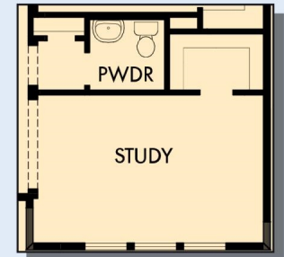
OPTIONAL STUDY WITH POWDER BATH AT BEDROOM 3 AND BATH 3