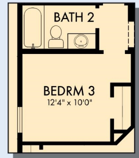
OPTIONAL BEDROOM 3 AT STUDY