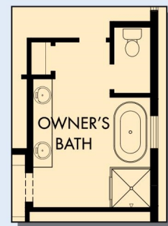
OPTIONAL FREE STANDING TUB AT OWNER'S BATH