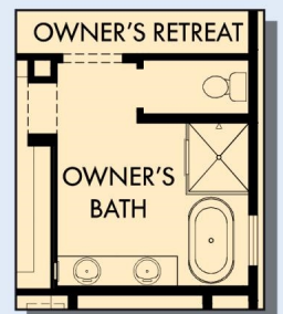
OPTIONAL FREE-STANDING TUB WITH SEPARATE SHOWER AT OWNER'S BATH