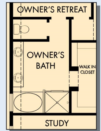
OPTIONAL SLIDE IN TUB WITH SEPARATE SHOWER AT OWNER'S BATH