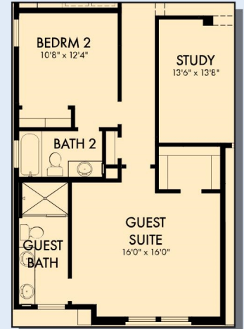
OPTIONAL GUEST SUITE WITH GUEST BATH AT BEDROOM 2 AND 3