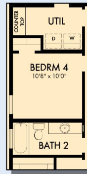
OPTIONAL BEDROOM 4 AT RETREAT