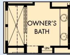
OPTIONAL WALK-IN SHOWER AT OWNER'S BATH