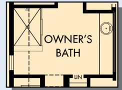
OPTIONAL STAND-ALONE SHOWER AT OWNER'S BATH