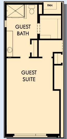
OPTIONAL GUEST SUITE WITH GUEST BATH AT BEDROOM 2 AND 3