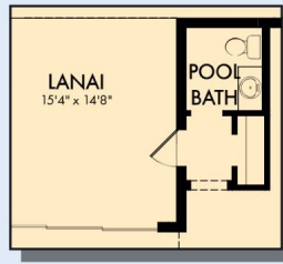
OPTIONAL POOL BATH

3,327 sq. ft. • 4 Bedrooms • 3 - 4 Full Baths • 1 Half Bath • 3 Car Garage