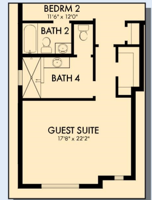
OPTIONAL GUEST SUITE WITH BATH 4 AT BEDROOM 3 AND RETREAT