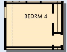
OPTIONAL BEDROOM 4 AT STUDY