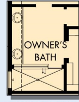
OPTIONAL WALK-IN SHOWER AT OWNER'S BATH