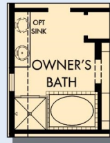
OPTIONAL DROP-IN TUB WITH SEPARATE SHOWER AT OWNER'S BATH