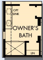
OPTIONAL SHOWER AT OWNER'S BATH