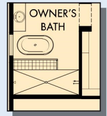
OPTIONAL FREE STANDING TUB AT OWNER'S BATH