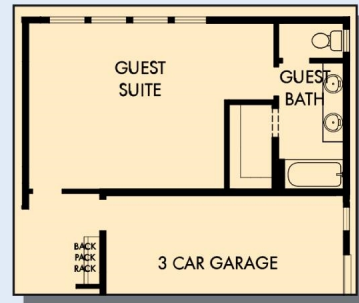
OPTIONAL GUEST SUITE WITH GUEST BATH AT GARAGE