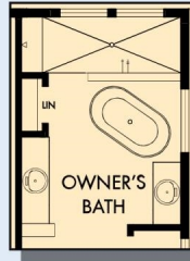
OPTIONAL FREE STANDING TUB WITH SEPERATE SHOWER AT OWNER'S BATH