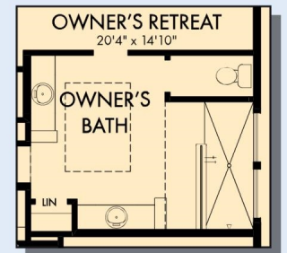
OPTIONAL SUPER SHOWER AT OWNER'S RETREAT