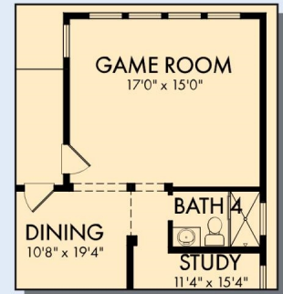
OPTIONAL GAME ROOM WITH BATH 4