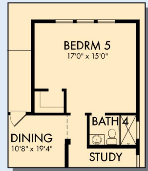
OPTIONAL BEDROOM 5 WITH BATH 4