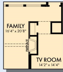
OPTIONAL WALL FIREPLACE AT FAMILY