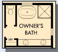
OPTIONAL FREE STANDNG TUB WITH SEPARATE SHOWER AT OWNER'S BATH