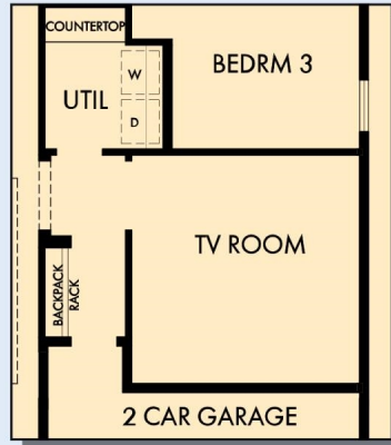
OPTIONAL TV ROOM AT GARAGE