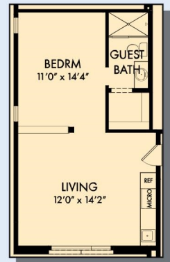
OPTIONAL CASITA AT BEDROOM 2 AND 3