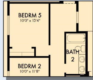
OPTIONAL BEDROOM 5 AT RETREAT

3,221 - 3,225 sq. ft. • 4 - 5 Bedrooms • 3 Full Baths • 1 Half Bath • 3 Car Garage