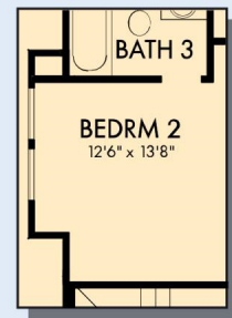
SECOND FLOOR WITH OPTIONAL ENHANCED SIDE

For additional options, please visit DavidWeekleyHomes.com