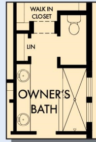
OPTIMAL SUPER SHOWER AT OWNER'S BATH