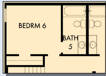
OPTIONAL BEDROOM 6 WITH BATH 5 AT RETREAT