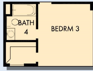
OPTIONAL BATH 4 AT BEDROOM 3