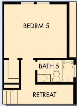
OPTIONAL BEDROOM 5 WITH BATH 5 AT RETREAT