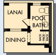
OPTIONAL POOL BATH AT SUNROOM