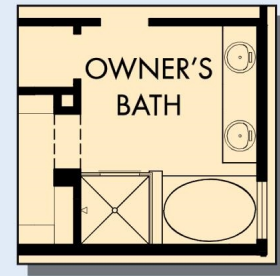
OPTIONAL SLIDE-IN TUB WITH SHOWER AT OWNER'S BATH