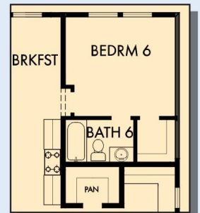
OPTIONAL BEDROOM 6 WITH BATH 6 AT SUNROOM