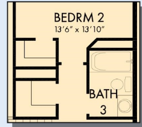
OPTIONAL BATH 3 AT BEDROOM 2