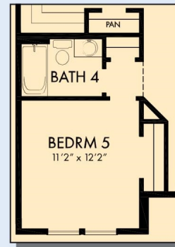
OPTIONAL BEDROOM 5 AND BATH 4 AT STUDY AND POWDER BATH