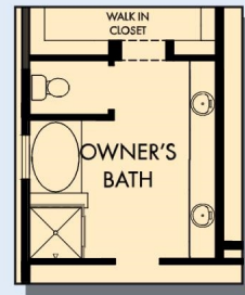
OPTIONAL SLIP-IN TUB WITH SEPARATE SHOWER AT OWNER'S BATH