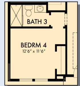
OPTIONAL BEDROOM 4 WITH BATH 3