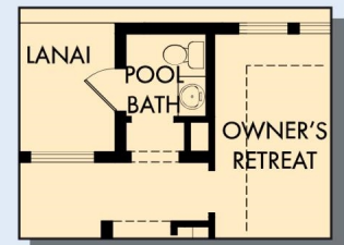
OPTIONAL POOL BATH AT LANAI