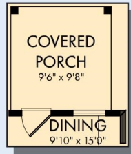
OPTIONAL COVERED PORCH AT DINING

2,033 - 2,114 sq. ft. • 3 Bedrooms • 2 Full Baths • 2 Car Garage