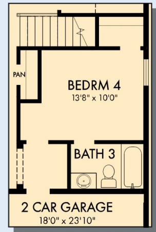
OPTIONAL BEDROOM 4 WITH BATH 3 AT STUDY