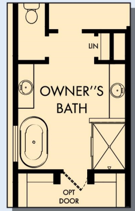
OPTIONAL FREE STANDING TUB WITH SEPARATE SHOWER AT OWNER'S BATH

For additional options, please visit DavidWeekleyHomes.com