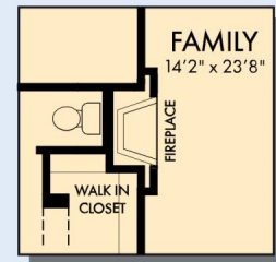
OPTIONAL WALL FIREPLACE AT FAMILY