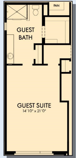
OPTIONAL GUEST SUITE WITH GUEST BATH AT BEDROOM 2 AND 3