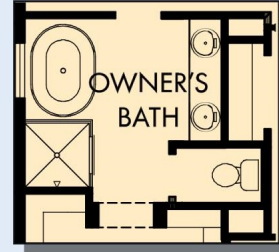
OPTIONAL FREE-STANDING TUB WITH SEPARATE SHOWER AT OWNER'S BATH