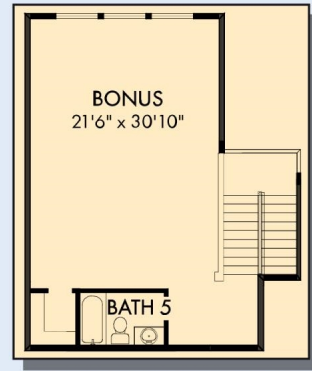
OPTIONAL SECOND FLOOR BONUS WITH BATH 5

For additional options, please visit DavidWeekleyHomes.com