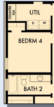
OPTIONAL BEDROOM 4 AT RETREAT