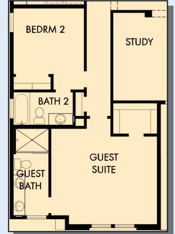
OPTIONAL GUEST SUITE WITH GUEST BATH AT BEDROOM 2 AND 3