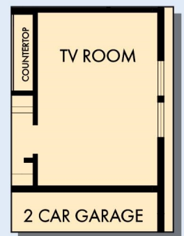
OPTIONAL TV ROOM AT GARAGE