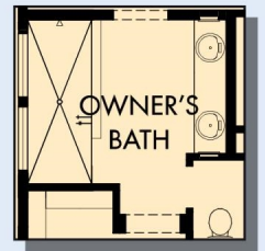
OPTIONAL SUPER SHOWER AT OWNER'S BATH