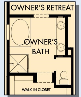
OPTIONAL DROP-IN TUB WITH SEPARATE SHOWER AT OWNER'S BATH