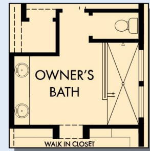
OPTIONAL SUPER SHOWER AT OWNER'S BATH