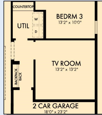
OPTIONAL TV ROOM AT GARAGE