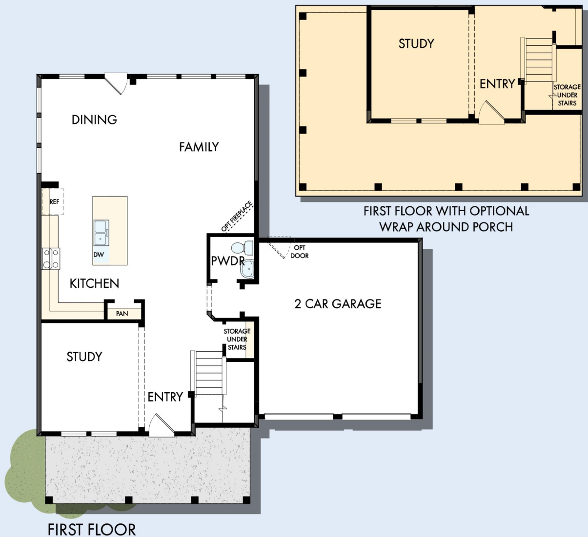
FIRST FLOOR WITH OPTIONAL WRAP AROUND PORCH