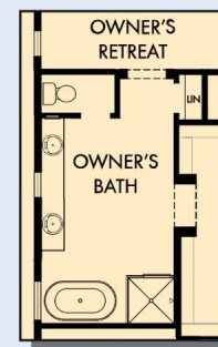
OPTIONAL FREE STANDING TUB WITH SEPARATE SHOWER AT OWNER'S BATH