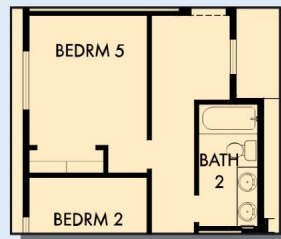
OPTIONAL BEDROOM 5 AT RETREAT

3,221 - 3,225 sq. ft. • 4 - 5 Bedrooms • 3 Full Baths • 1 Half Bath • 3 Car Garage