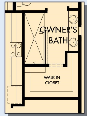
OPTIONAL SUPER SHOWER AT OWNER'S BATH