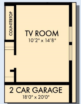
OPTIONAL TV ROOM AT GARAGE