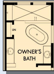
OPTIONAL FREE STANDING TUB WITH SEPERATE SHOWER AT OWNER'S BATH